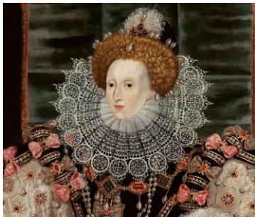
(Above) Portrait of Elizabeth I (1533 - 1603) The Armada Portrait 1600c. George Gower, Manner of c.1540 – 1596 (Below) Sir Walter Raleigh, French School, (16th century)

Explain to students how only rich people wore lace in the past. It was so beautiful and so expensive that it made people feel really important when they wore it. Both men and women wore lace.